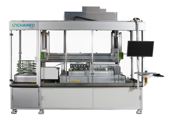
Figure 1: Big Kahuna with buffer exchange automates buffer exchange for up to 96 unique samples with the Unfilter 96.

Conventional exchange methods are labor intensive, prone to inconsistency, and difficult to manage in larger numbers. Automated buffer exchange systems can provide a more uniform sample handling approach and degrees of process control that are otherwise inaccessible by manual methods. Automating a platform buffer screen can further cut down the time required to optimize buffer conditions for new biologic mol-