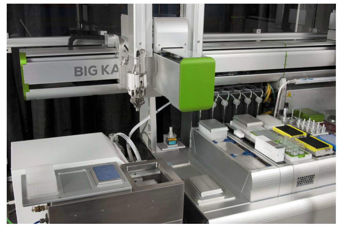
Big Kahuna with buffer exchange module (left)

Big Kahuna lets you skip the dialysis cassettes, desalting columns and trips to the centrifuge that come with manual processes. It automates buffer exchange using our proprietary Unfilter consumable with a combo of pressure-based ultrafiltration and gentle mixing. While it's churning out protein formulations on up to 96 samples, use the time you get back to attack the other big things on your to-do list.